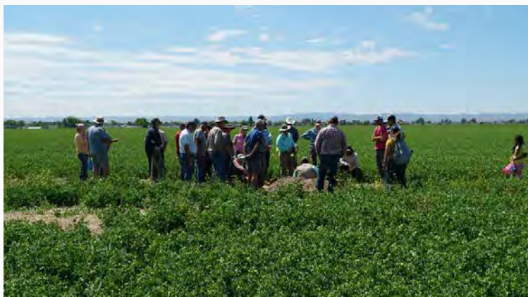
NRCS employees discuss soil properties of a reduced-till field with Field Day attendees

Thank you to everyone who came to the Magic Valley Field Day this June in Kimberly. Over 70 people showed up to discuss and see soil health in action. The location was particularly great for demonstrating soil health with adjacent fields under different management, perfect for viewing the differences between a more conventional management system and the other reduced tillage system. Our speakers Linda Schott (UI Extension), Shawn Nield (NRCS), and Nick Sirovatka (NRCS) presented hands-on learning opportunities, discussing active carbon (see below), comparing soil pits in contrasting fields, and showing an in-field soil health assessment. The event was rounded out with a water infiltration demonstration using a rainfall simulator, followed by free lunch. Thanks again to Todd Ballard and The Nature Conservancy for hosting and to all our sponsors for making this event happen!