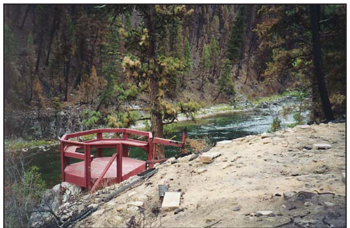
Burns along streams and rivers affects not only the land, but the water that flows through it.

Erosion is defined as “the movement of individual soil particles by wind or water.” This is a natural process occurring on landscapes at different rates and scales, depending on geology, topography, vegetation, climate, and weather.