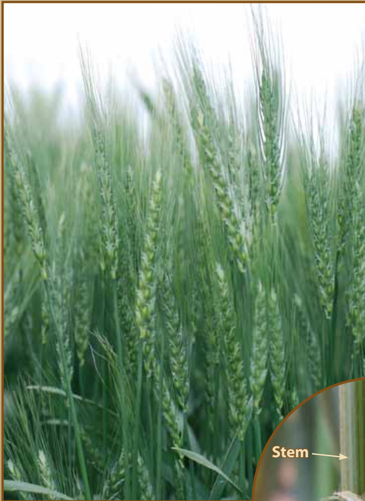
Figure 1. The diagnosis of rust diseases requires some basic understanding of plant anatomy and a quick review of this information may improve the accuracy of the identification process.

depends on host susceptibility and weather conditions, but the loss also is influenced by the timing and severity of disease outbreaks relative to crop growth stage. The greatest yield losses occur when one or more of these diseases occur before the heading stage of development. Early detection and proper identification are critical to in-season disease management and future variety selection.