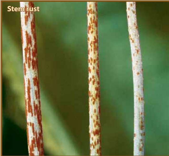
Figure 3. Examples of the variability in symptoms caused by stem rust (below), leaf rust (upper right) and stripe rust (lower right) as a result of unique interactions with wheat or barley varieties.

All three diseases have unique interactions with common varieties of wheat and barley. These interactions can modify the disease symptoms resulting in reduced lesion size and varying amounts of yellow or tan tissue surrounding the lesions (Figure 3). Becoming familiar with the range of possible symptoms for these diseases will improve the accuracy of the diagnosis and the management of these economically important diseases.