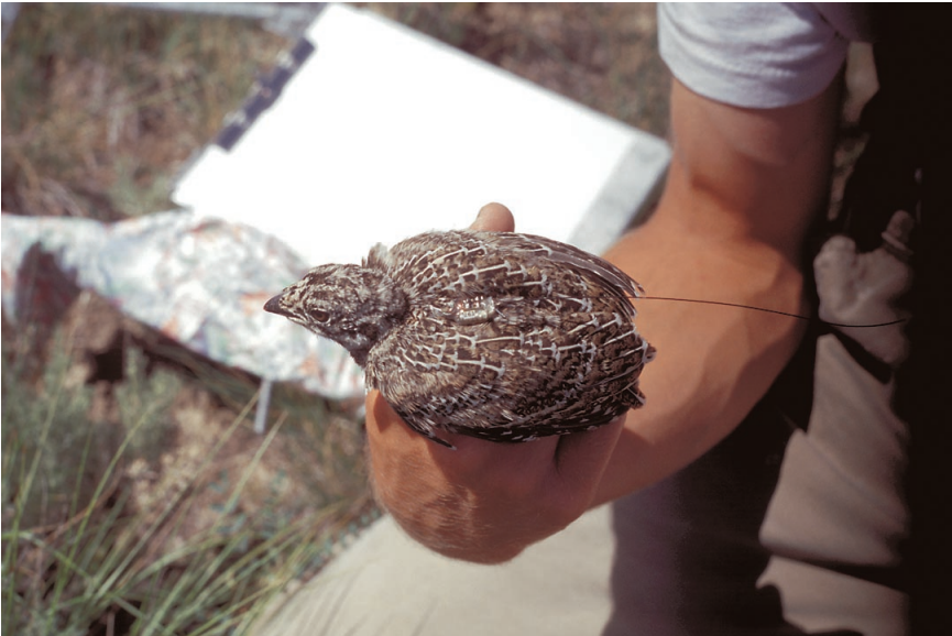
Figure 8. Three-week old sage-grouse with 1-gm radio transmitter. Note antenna extends posteriorly.

Although a great deal of information has been obtained from radio-marked sage-grouse, virtually all of the birds marked were older than 10 weeks of age. Few, if any attempts, were made to radio-mark sage-grouse chicks less than 10 weeks old until 1998. A major concern involved the attachment of a transmitter to a day-old chick weighing about 30 grams. The technique should pose a low risk to grouse chicks but still result in an attachment that lasted at least two weeks. A simple attachment arrangement has been developed for a sage-grouse chick that involves piercing the skin just in front and behind the transmitter with a 20-gauge hypodermic syringe. Sutures are then threaded through the syringe and through holes in the 1-gm transmitter and tied off (Figure 8). Cyanoacrylic glue is applied to the knots to enhance security of the attachment (Burkpile et al. 2002).