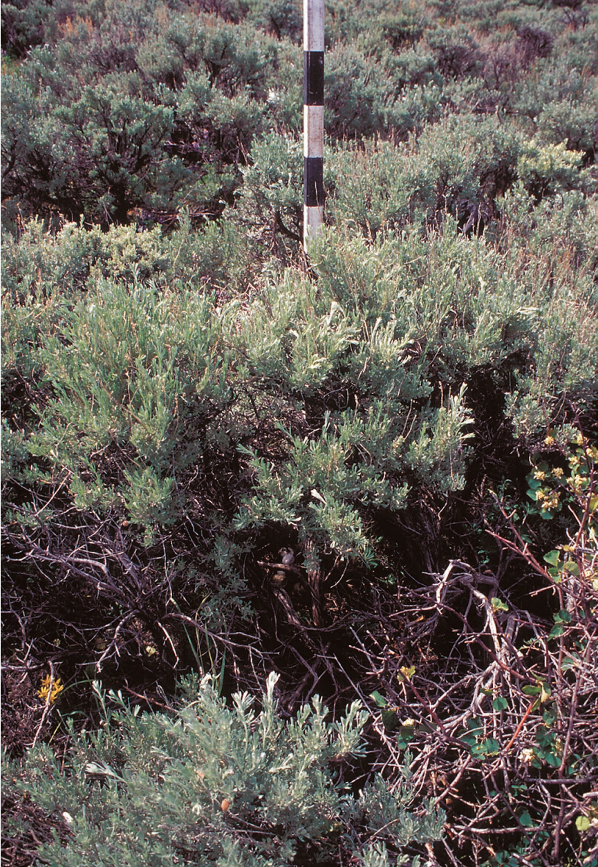
Figure 4. Robel pole showing amount of visual obstruction at a successful sage-grouse nest.

ber stopper until sampling begins. We suggest sampling over at least one 24-hour period from late May to mid-June (a time coinciding with the early brood-rearing period).