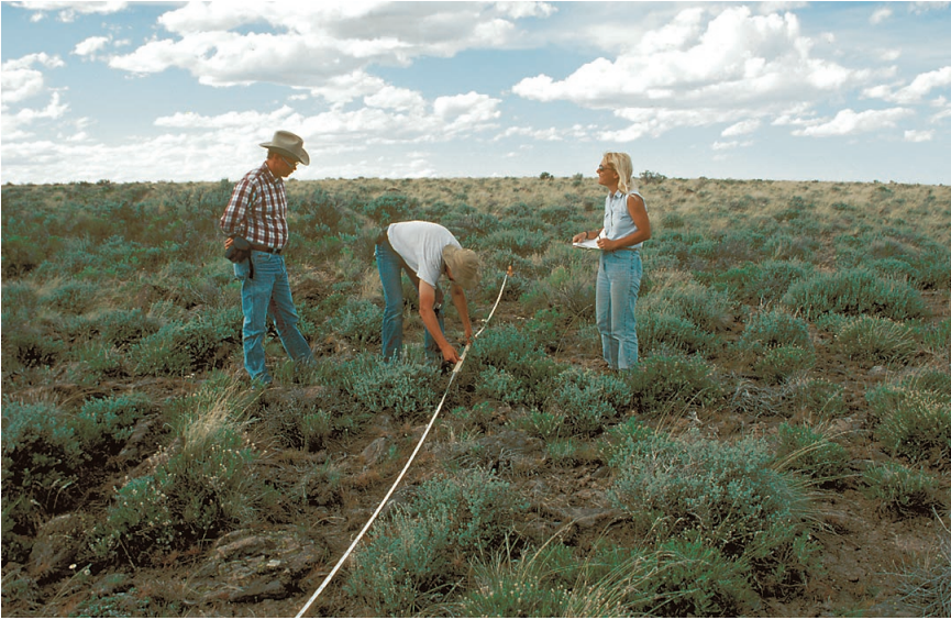
Figure 1. The line intercept method is used to measure shrub canopy cover.

Line intercept may be somewhat more time consuming than other methods of estimating cover, but it is less subjective than other methods, generally has greater accuracy and precision than other methods (Higgins et al. 1994), and is widely accepted as a method for estimating shrub canopy cover. Use of line intercept also allows direct comparison with data from many other studies because this is a very common method of measuring sagebrush canopy cover (Wakkinen 1990, Connelly et al. 1991, Gregg et al. 1994, Fischer 1994, Holloran 1999, Lyon 2000).