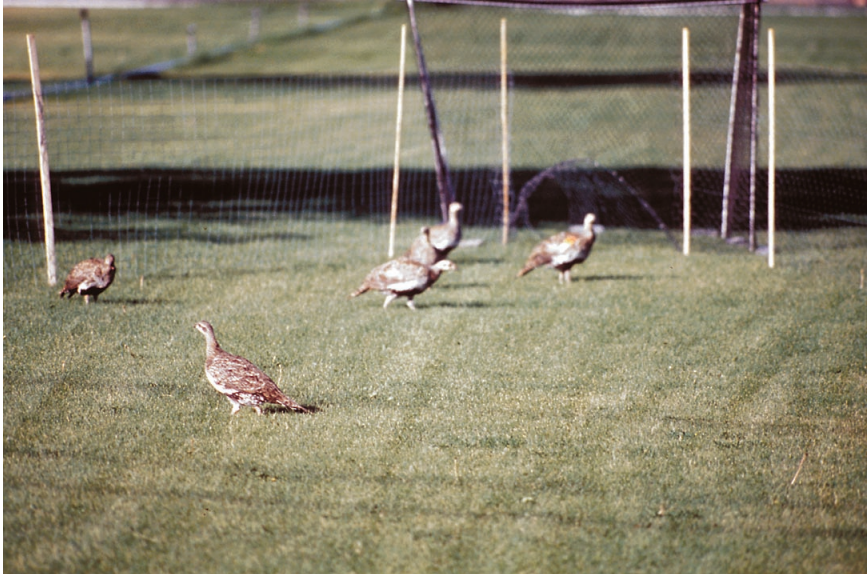
Figure 7. Walk-in trap for sage-grouse on atypical summer range (lawn at the Idaho National Engineering and Environmental Laboratory).

Well-trained pointing dogs can be used to capture sage-grouse chicks up to about four weeks of age. We used pointing dogs to capture the chicks of radio-marked hens by first locating and flushing the hen. We then let the dog search an area within about a 200 m radius of the site where the hen flushed. The dog will normally go on point within 50 cm of the chick and then it is a matter of reaching down and picking up the chick. For older chicks (more than two weeks old) a long-handled net can be used to capture the bird. Experienced, steady dogs are necessary for this technique to be successful.