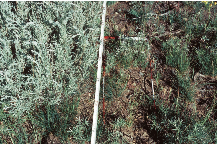
Figure 3. Daubenmire frame placed along a 50-m tape for estimation of herbaceous cover.

Except in a very general way (e.g., classifying herbaceous cover as relatively dense or sparse), ocular estimates should be avoided because shrub overstory can block much of the understory from view. Moreover, shrubs and grasses may obscure the forb component.