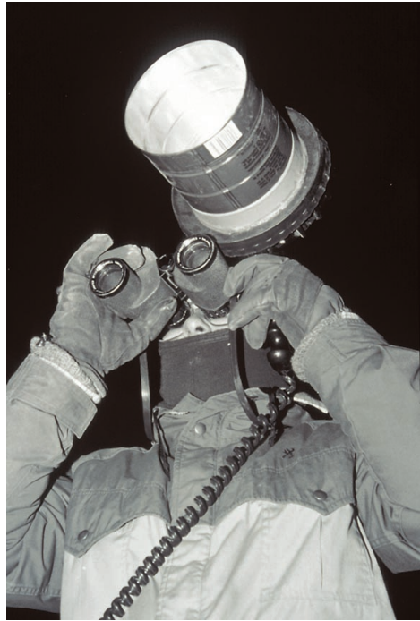
Figure 6. Night-lighting sage-grouse.

Sage-grouse eyes resemble sparkling emeralds in the glare of a spotlight and can be seen for over 200 m, depending on terrain and vegetation. Depending on distance, it may not be possible to distinguish males from females. Normally, males, when viewed from less than 100 m, can be identified by their white breast feathers. Location of the bird with respect to the lek also provides a clue to the gender of the observed bird. Males tend to roost singly in the relative open area of the lek and sometimes on sparsely vegetated ridges adjacent to the lek. Females are often more secretive, roosting closer to sagebrush at the perimeter of the lek, sometimes in small groups.