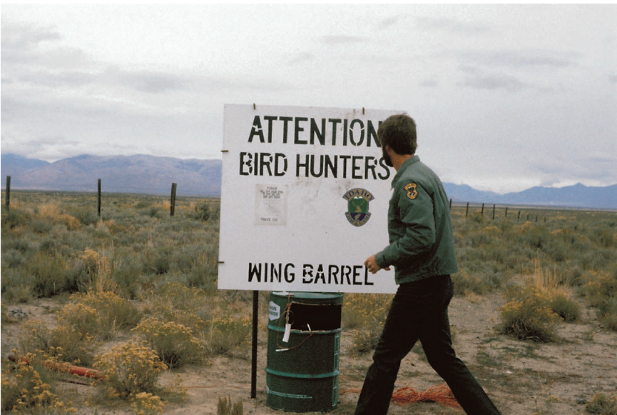
Figure 5. Wing barrel used to collect gamebird wings.