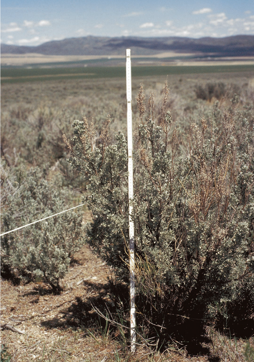
Figure 2. Shrub and grass heights are measured with a meter stick.

tion with estimating canopy cover. The tallest live part of shrubs occurring along a transect or within a plot is recorded (Figure 2). Normally the average height is reported. Time of year may affect height measurement and observers should indicate whether seed heads were included in their measurements.