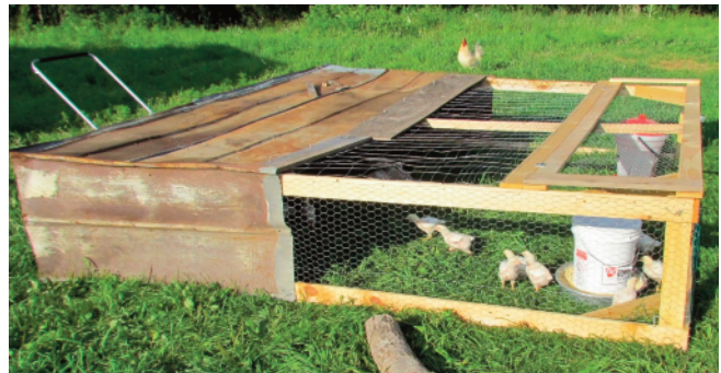
Figure B1. Chicken tractor design with recycled tin roofing