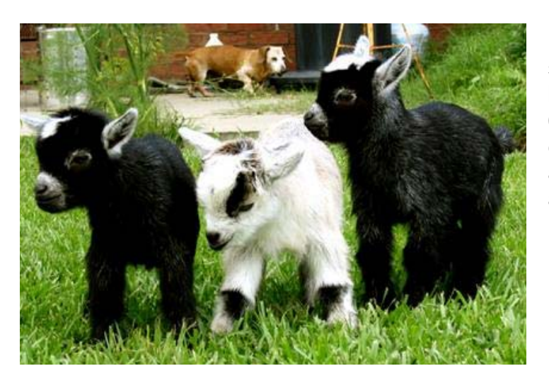
PYGMY goats are smaller than other breeds, usually about 60 pounds. These easy to handle animals are versatile and make great pets.

ANGORA or "CASHMERE" goats originated in Asia. They produce mohair which is shorn twice each year. Cashmere is not a breed but a description of goats that produce very fine hair fiber.