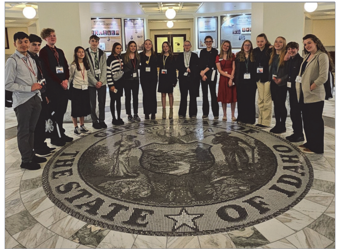
Delegates tour the state capitol after completing a hearing on a Bill presented by a peer for the mock legislative session.

4-H's Know Your Government Conference (KYG) gives youth the opportunity to explore their Sparks, experience a sense of belonging, and benefit from supportive relationships from adults and peers. Research tells us that these factors drive the 4-H Thriving Model and outcomes like social competence, positive academic attitude, personal responsibility, personal standards, contribution and connection with others. The KYG conference provides the experience to build these outcomes in youth. This year 159 youth in grades 8 to 11 participated from 25 of 44 counties and one of the three Federally Recognized Tribal Extension Programs in Idaho. That was a growth of 39 youth over the previous year.