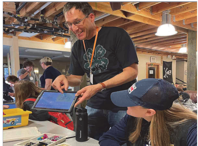
4-H youth participate in an AgRobotics class to help lead classes in their counties.

The objective of LEADS is to challenge youth in supportive ways to encourage them to learn, grow and improve their leadership skills through various