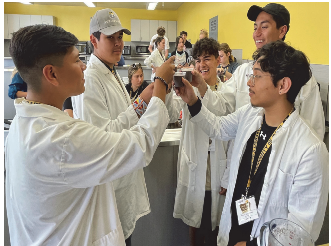
4-H health advocates taught their peers how to prepare nutritious recipes during a STAC workshop session.

STAC is a four-day, three-night event for teens on the University of Idaho campus. The program includes educational workshops and tours, on-campus living, community service projects, opportunities to develop leadership skills and build supportive relationships with peers and adults. STAC is planned by a steering committee of youth, 4-H professionals and volunteers throughout Idaho. Each general session is chaired by state 4-H officers who serve a one-year term upon