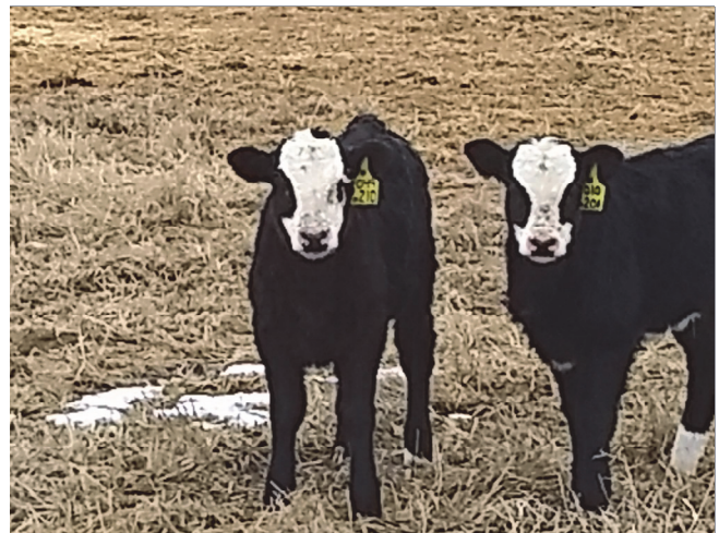
Over 500 calves have been produced from sex-sorted semen at the U of I Nancy M. Cummings center.