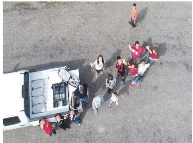
Aerial picture of 4-H youth waving at a drone taken at Drone School in Madison County.

The Madison County advisory committee requested more STEM programs for 4-H youth. University of Idaho Extension, Madison County faculty and staff followed up on this request, obtained a STEM grant and