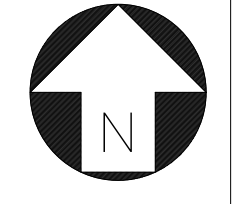
MAIN CAMPUS SNOW HANDLING MAP NOT TO SCALE