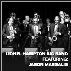
LIONEL HAMPTON BIG BAND FEATURING: JASON MARSALIS