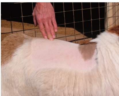
BCS 4. The backbone and ribs cannot be seen. The ribs are sleek and the bones can barely be felt under a layer of fat.