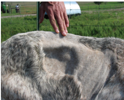
BCS 1. Weak and bony. You can fit your fingers between the bones of the backbones and rib bones. No fat and little muscle.