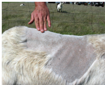
BCS 2. Slight fat cover on the ribs, but you can still see and feel the backbone and spaces between the ribs.