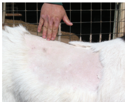
BCS 5. The backbone and ribs are so deeply covered in fat as to not be seen or felt.