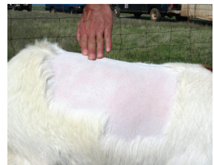
BCS 3. The backbone is visible, but does not stand out. You must press firmly to get your fingers between the ribs and they have a moderate covering of fat.