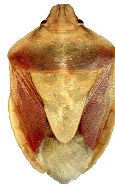
Antheminia eurynota remota (9-10 mm)