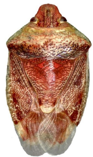
Banasa dimidiata (7-10 mm)