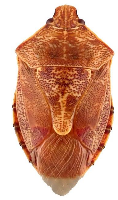
Podisus placidus (8-12 mm)