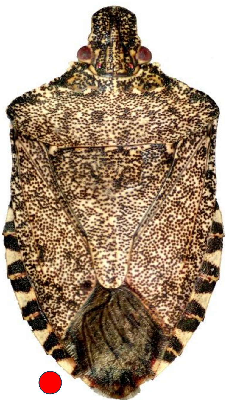
Halyomorpha halys (14-17 mm)