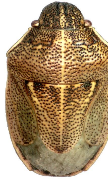
Neottiglossa undata (4.5-6 mm)