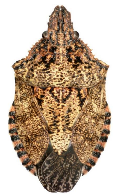
Brochymena sulcata (12-16 mm)