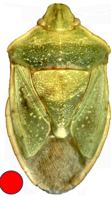
Chlorochroa uhleri (12-16 mm)