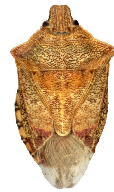
Podisus maculiventris (9.5-14 mm)