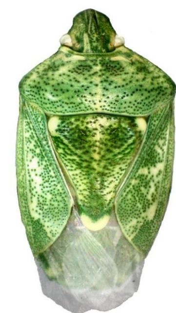
Banasa euchlora (8-11 mm)