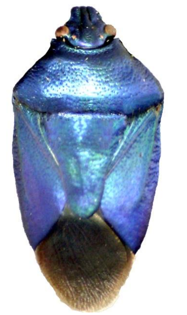
Zicrona americana (4.5-7.5 mm)