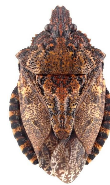
Brochymena affinis (14-18 mm)