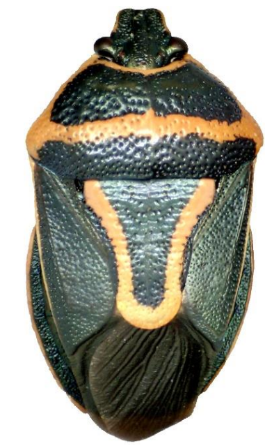
Perillus splendidus (8-9 mm)