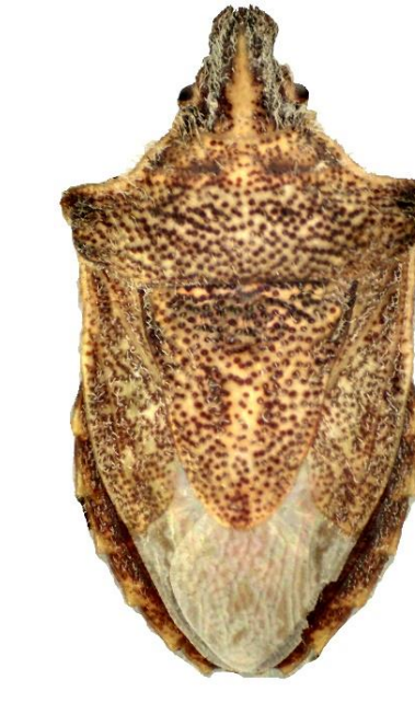
Prionosoma podopoides (8.5-11 mm)