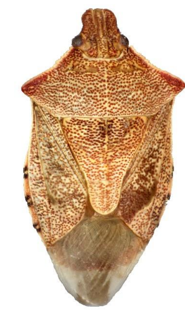
Podisus brevispinus (8-12 mm)