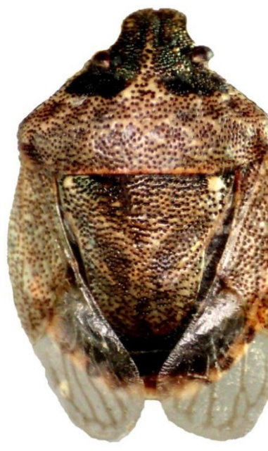
Cosmopepla intergressa (4-6 mm)