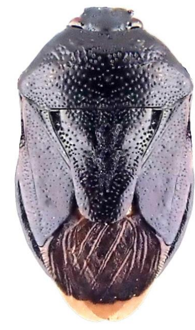
Perillus exaptus (5-8 mm)