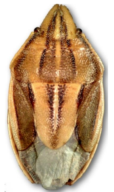
Aelia americana (7-9 mm)