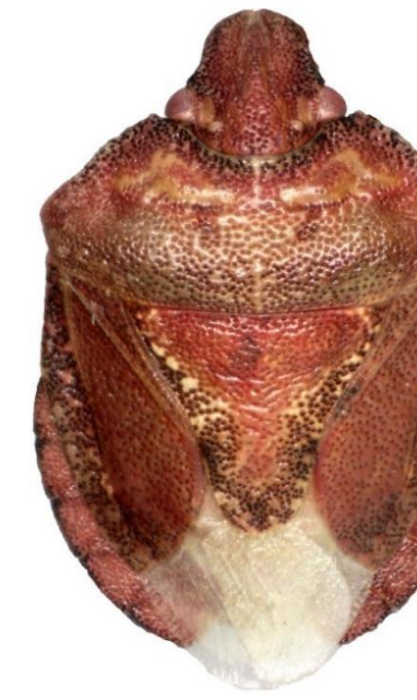
Dendrocoris pini (5.5-7 mm)