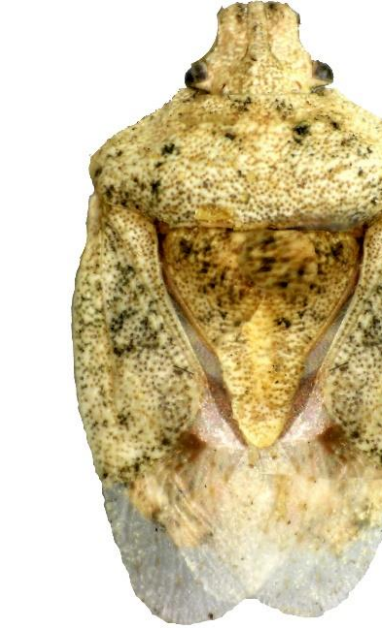
Tepa rugulosa (5-7 mm)