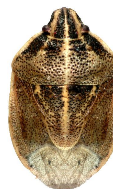
Trichopepla atricornis (6-8 mm)