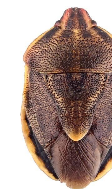
Trichopepla grossa (9-10 mm)