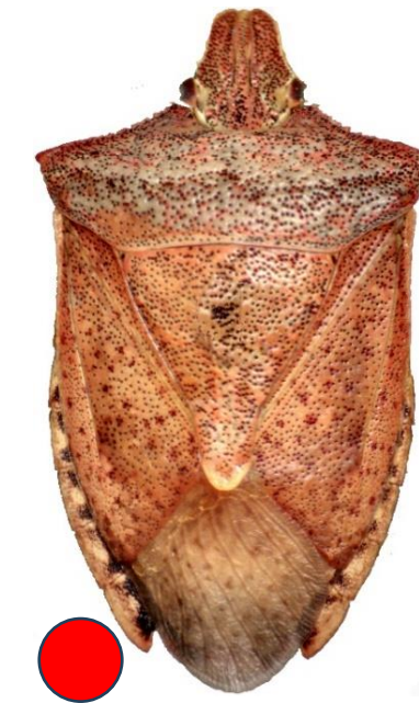
Euschistus variolarius (11-15 mm)