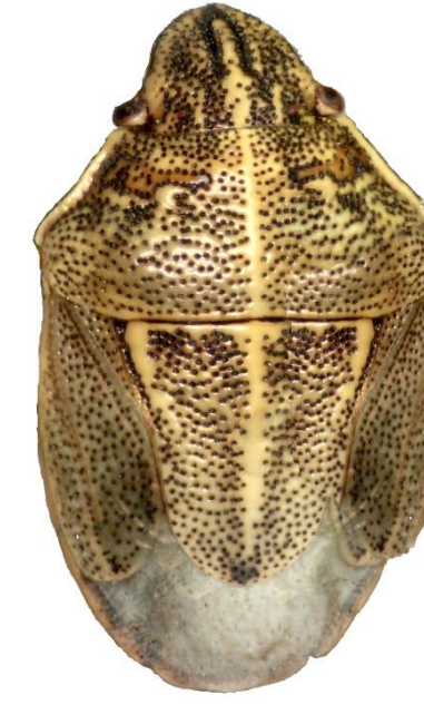
Neottiglossa tumidifrons (4-5 mm)