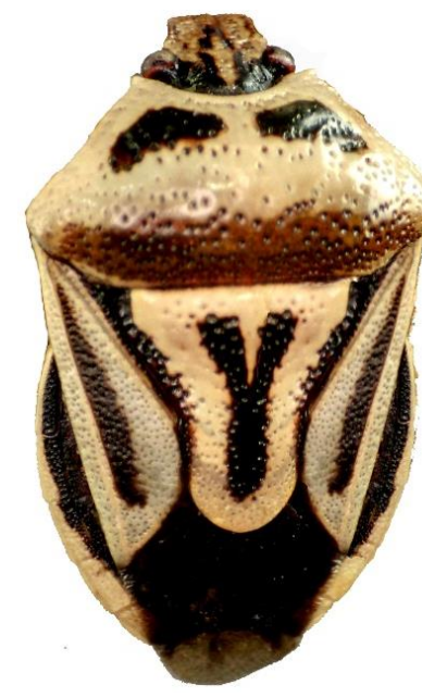
Perillus bioculatus (8.5-11.5 mm)