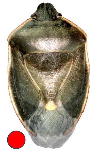
Chlorochroa ligata (13-19 mm)