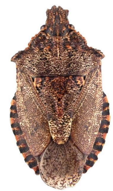
Brochymena quadripustulata (13-18 mm)