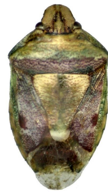
Banasa tumidifrons (7-9 mm)