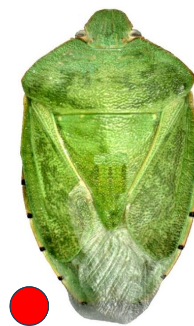
Chinavia hilaris (13-19 mm)