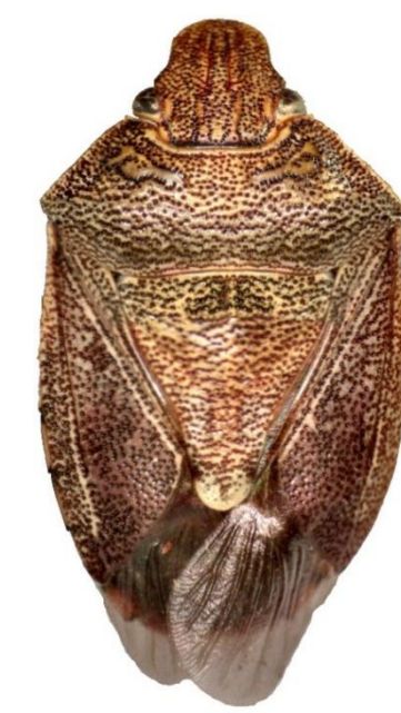
Banasa sordida (10-11.5 mm)