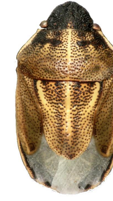
Neottiglossa trilineata (5-6 mm)