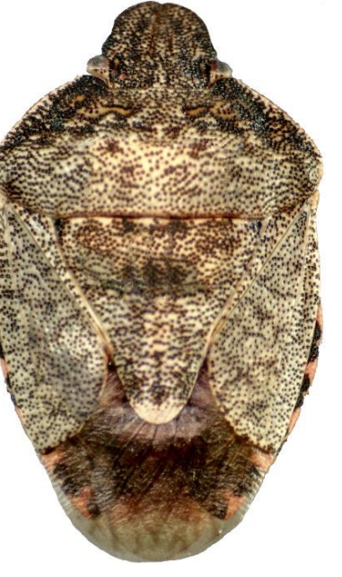
Holcostethus abbreviatus (8-9.5 mm)