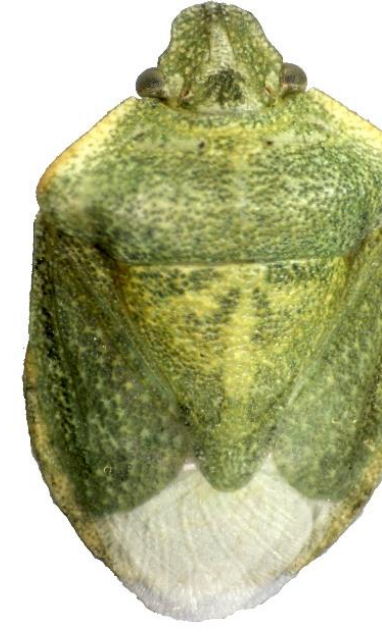
Tepa yerma (5.5-7 mm)