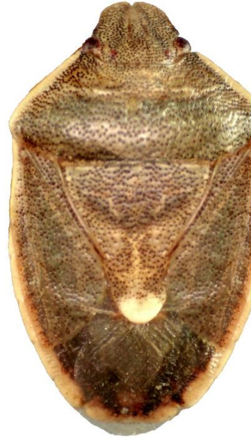
Holcostethus limbolaris (7-9 mm)