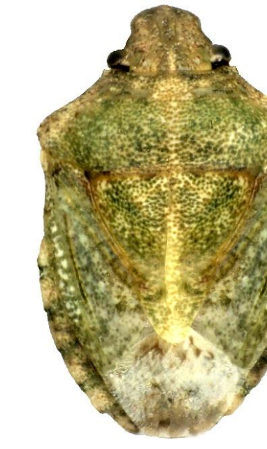
Tepa vanduzeei (5-8 mm)