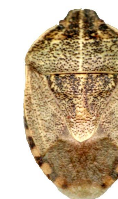
Trichopepla dubia (6.5-8 mm)