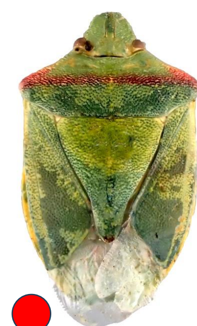
Thyanta pallidivirens (9-11 mm)