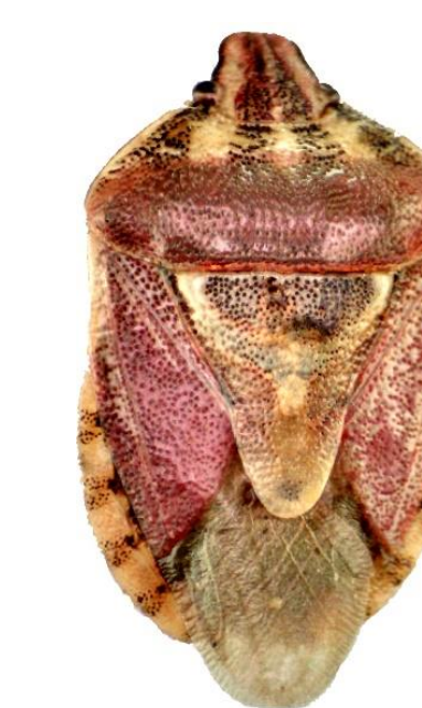
Trichopepla aurora (8.5-9 mm)