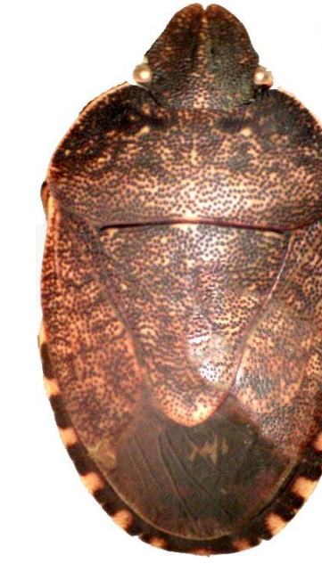
Holcostethus tristis (7.5-8.5 mm)