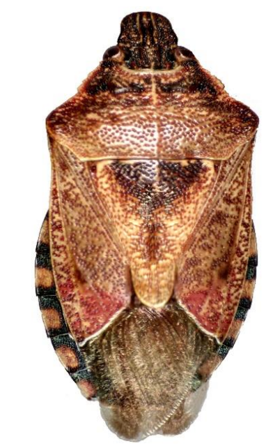
Podisus sericeiventris (8.5-12 mm)