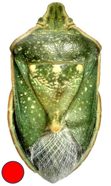
Chlorochroa sayi (10-16 mm)