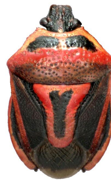
Perillus bioculatus (8.5-11.5 mm)