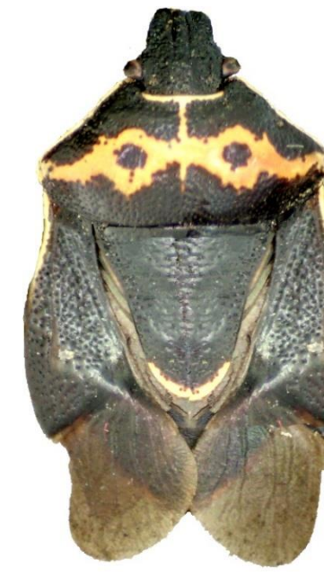
Cosmopepla conspicularis (6-8 mm)