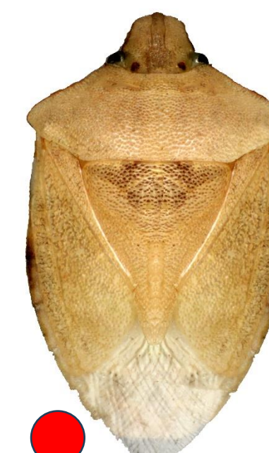
Thyanta pallidivirens (9-11 mm)