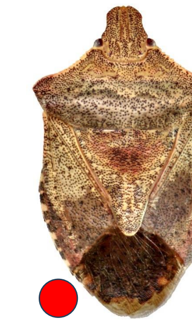
Euschistus conspersus (11-12 mm)