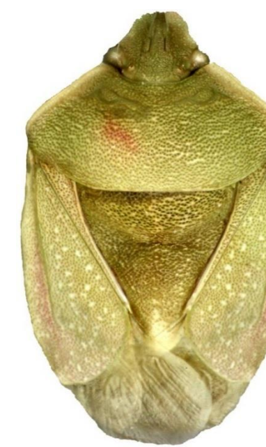
Chlorochroa congrua (9-11 mm)