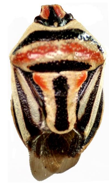
Perillus lunatus (7-8 mm)