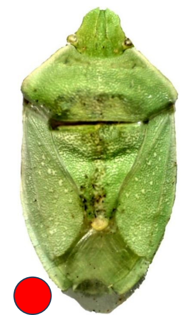
Chlorochroa granulosa (11-13 mm)