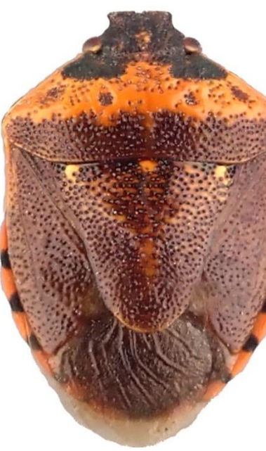
Cosmopepla uhleri (4-6 mm)