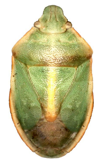
Chlorochroa faceta (9-11 mm)