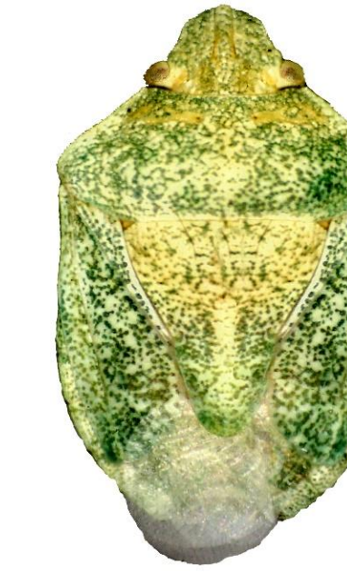
Tepa brevis (6 mm)