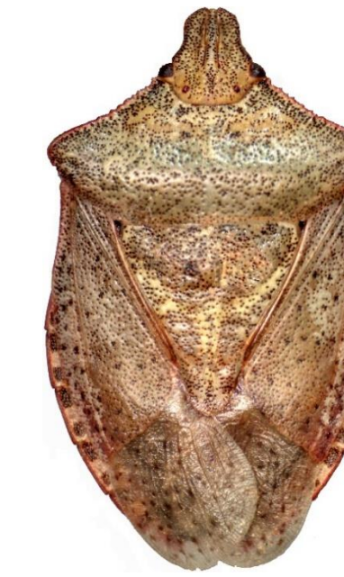
Euschistus inflatus (11-13 mm)