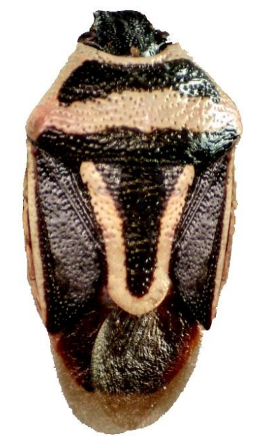
Perillus exaptus (5-8 mm)