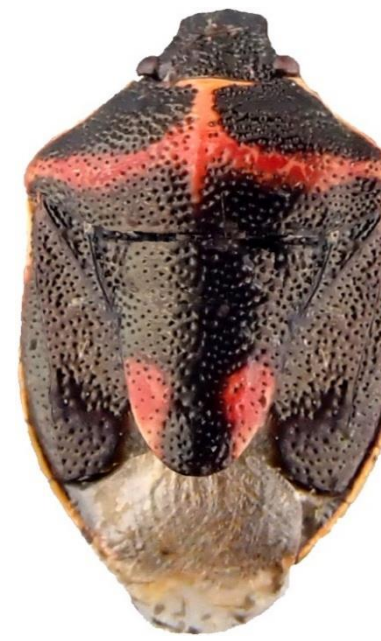
Cosmopepla lintneriana (4-7 mm)