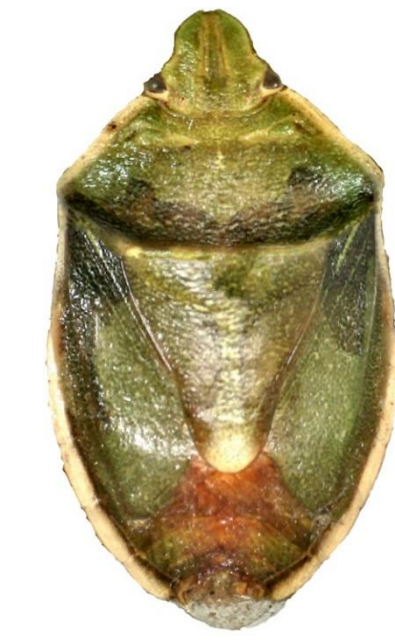
Chlorochroa opuntiae (11-16 mm)