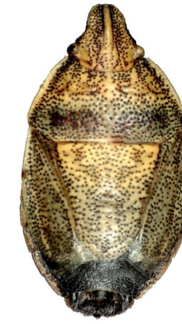
Coenus delius (8.5-10.5 mm)